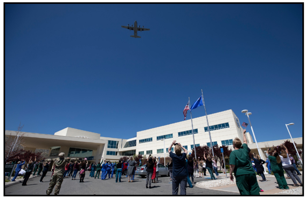
A 152nd Airlift Wing C-130 soars over Carson Tahoe Medical Center as part of the unit's Salute to Medical Professionals for its flyover of 13 hospitals in northern Nevada and California during the region's COVID-19 outbreak in April 2020.